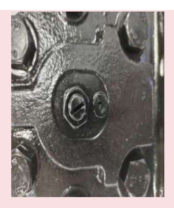
NO SERIAL NUMBERS