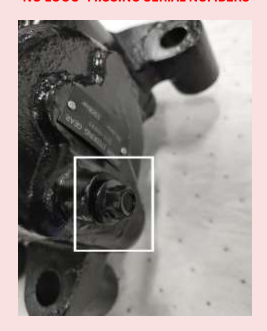
FLANGED HEAD BOLT