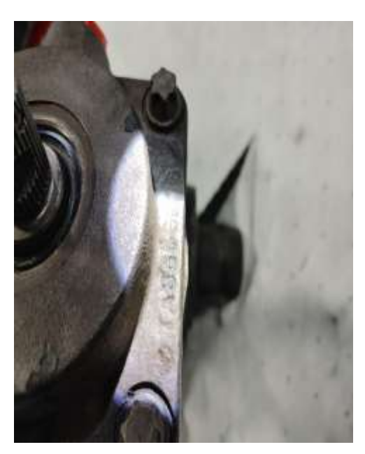
CAST MODEL NUMBER