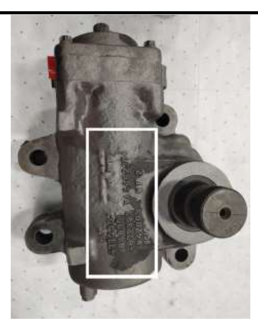
TRW LOGO AND SERIAL NUMBERS STAMPED INTO HOUSING