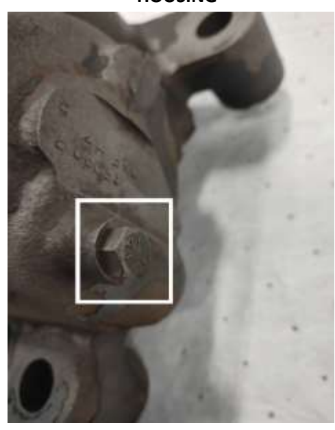
HEX HEAD BOLT