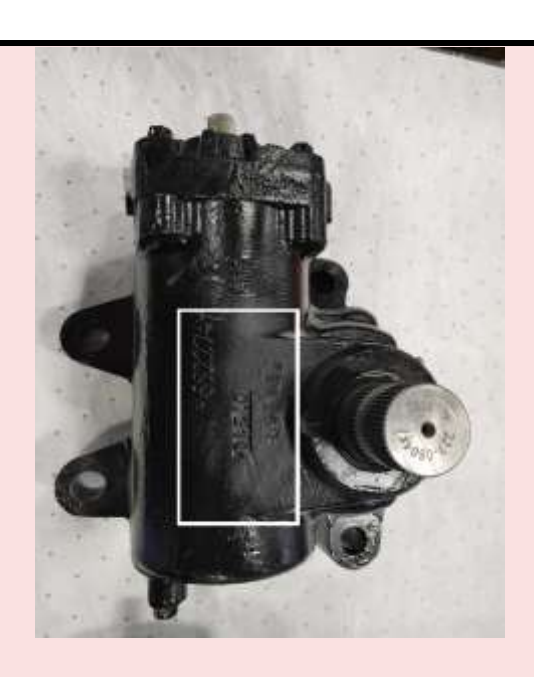
NO LOGO- MISSING SERIAL NUMBERS